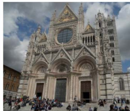
Tuscany: Cathedral of Siena.

Meet our Young Travel Writers 2012. Jadviga Kobryn-Coletti is one of 10 students to win a Canon G12 camera each and join the West Travel team on a workshop day with Western Australian Museum.