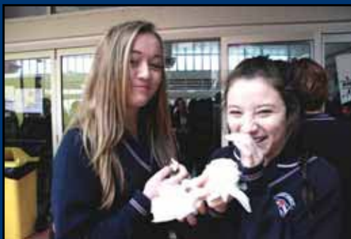
Chinese - Baozi