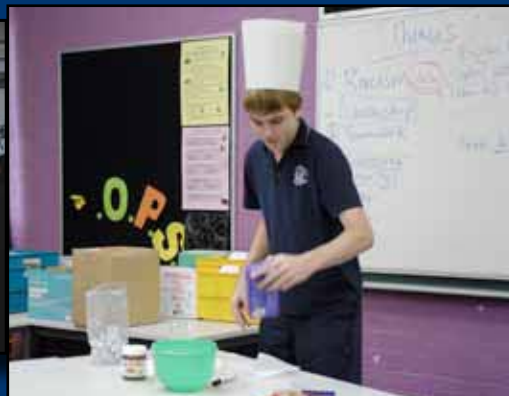
Italian - making Baci