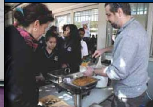
Indonesia - Curry