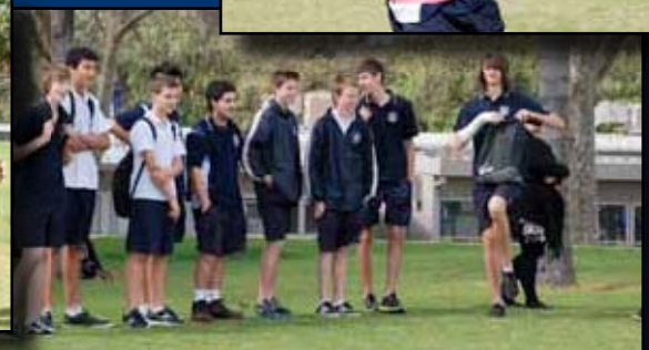
Indonesian - Tarian