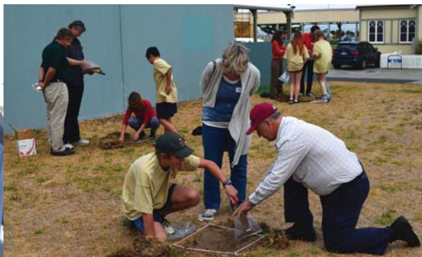
Mt Lawley Bush cadets taking soil samples for the MicroBlitz project