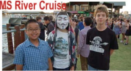
MS River Cruise