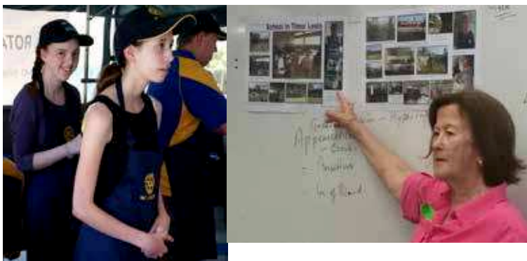
Rotary Sausage Sizzle