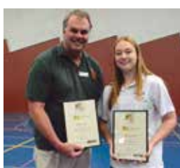
Bush Rangers Video Competition Winner