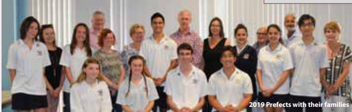
2019 Prefects with their families