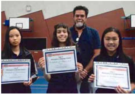
The Principal's Language Awards Year 7-9