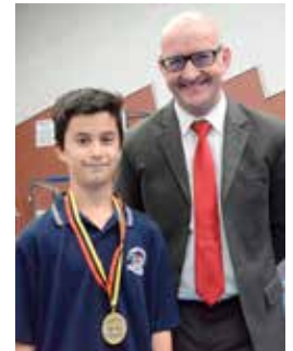
The NAIDOC Medal Winner for creative writing.