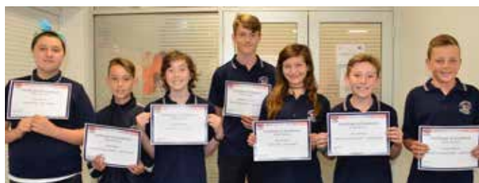
Year 7 Certificate of Excellence Awards Skilful Me Expo