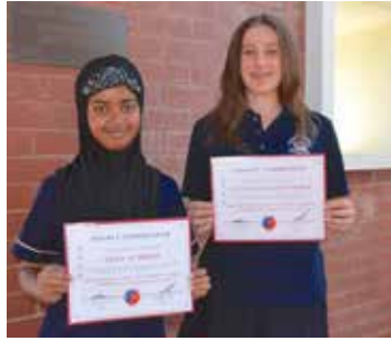
The ACSF Chinese Language Awards