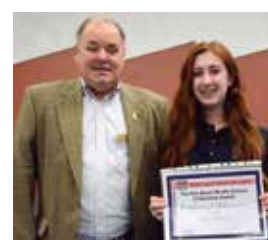
The Des Beard Middle School Citizenship Awards