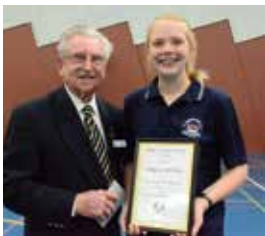
Middle School Poetry Prize Supported by the Lodge of Sincerity