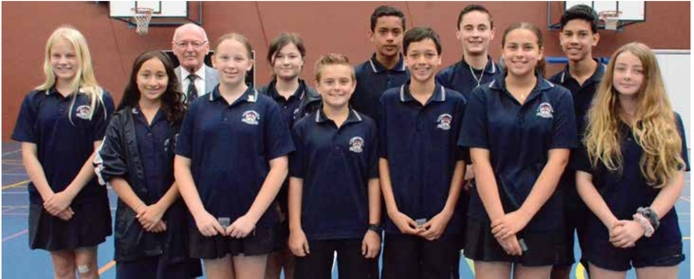
Year 8 Councillors for 2019