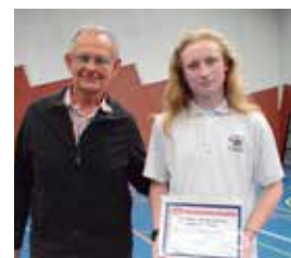
The Walter Horeb Literacy Award for Prose