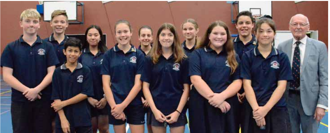
Year 9 Councillors for 2019