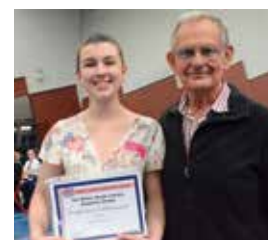
The Walter Horeb Literacy Award for Poetry