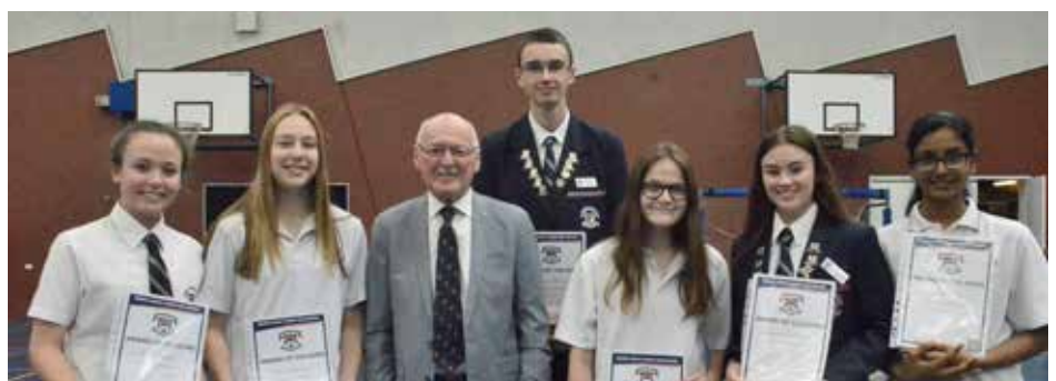
Students who have received their Colours for 2018