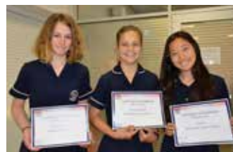
Certificate of Excellence Awards Skilful Me Expo