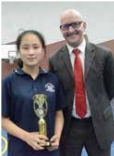
The Chinese Language Teachers Association (CLTAWA) Writing Competition Winner