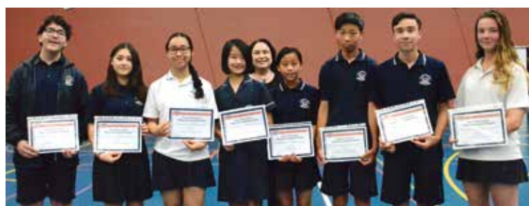
The Principal's Gifted and Talented Awards Years 7-10