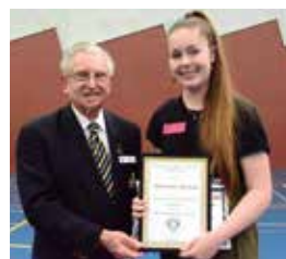
Arthur Leggett Writing Prize Supported by the Lodge of Sincerity