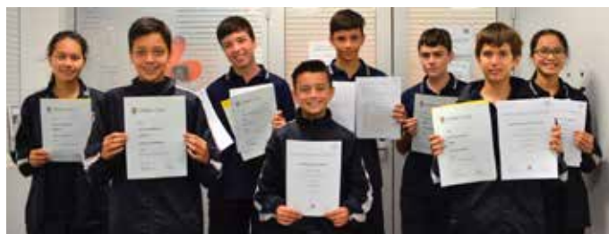
Year 7 ICAS Maths Competition & Australian Maths Competition Winners