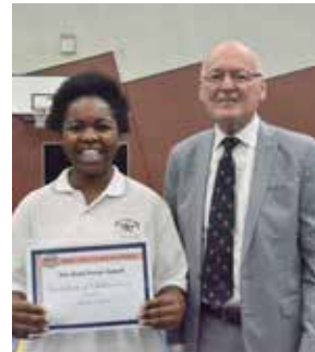
Alma Porter Award