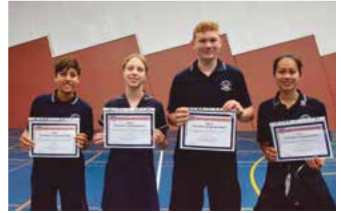
The Principal's Language Awards Year 7-9