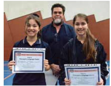
The Principal's Language Awards Year 8-9