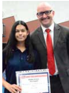
Middle School Dux Award