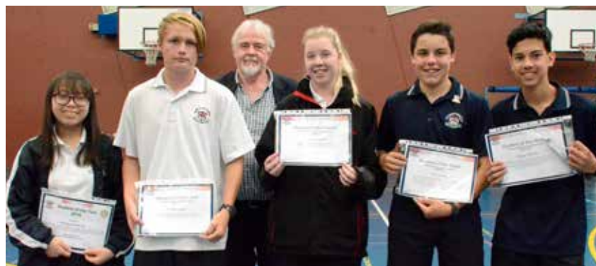
Students of the Month and Student of the Year Awards.