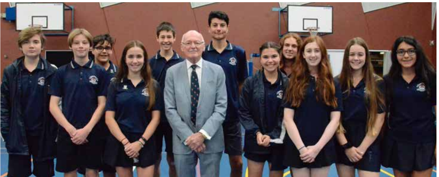
Year 10 Councillors for 2019