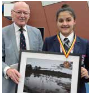
2018 Young Australian Art Medal