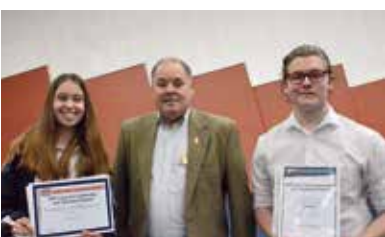
ADF Long Tan Leadership & Teamwork Award