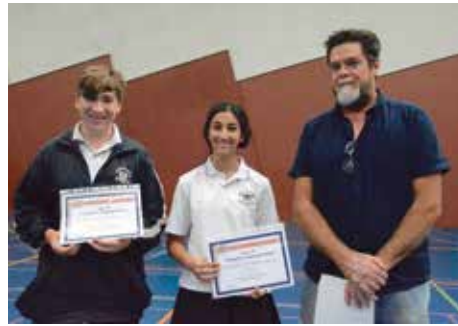
The Principal's Language Awards Year 10