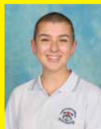
Isabel Mountain Psychology