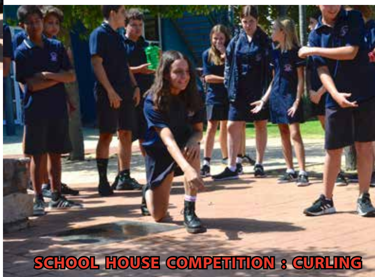
SCHOOL HOUSE COMPETITION : CURLING