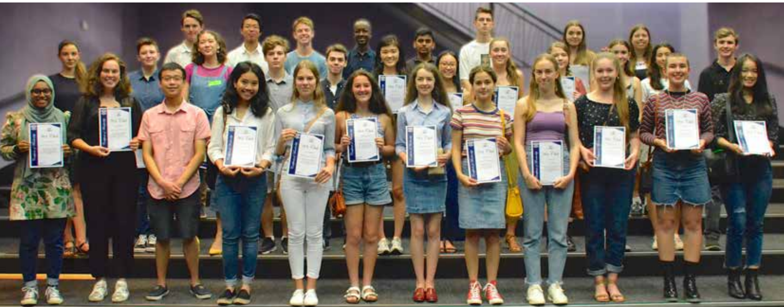
2018 Inductees to the Mount Lawley Senior High School 90's Club