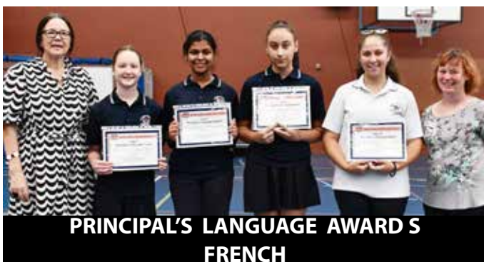
PRINCIPAL'S LANGUAGE AWARD S FRENCH