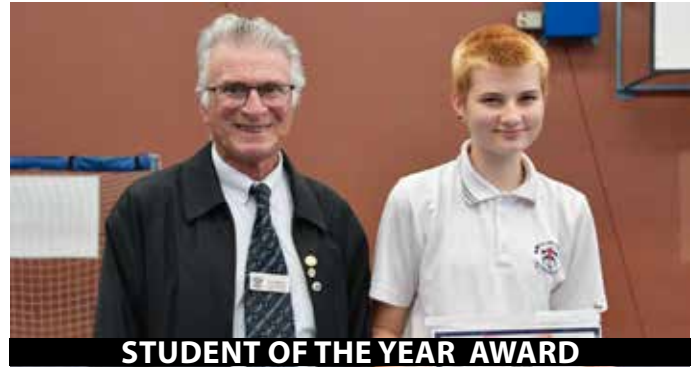
STUDENT OF THE YEAR AWARD