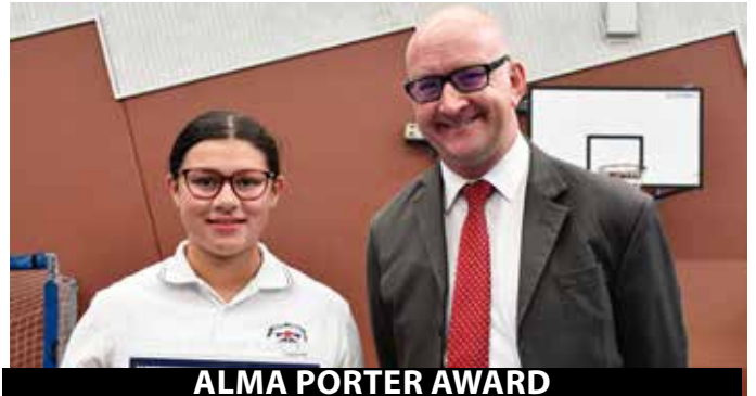
ALMA PORTER AWARD