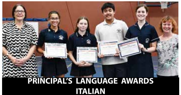
PRINCIPAL'S LANGUAGE AWARDS ITALIAN