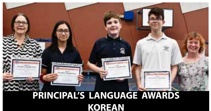
PRINCIPAL'S LANGUAGE AWARDS KOREAN