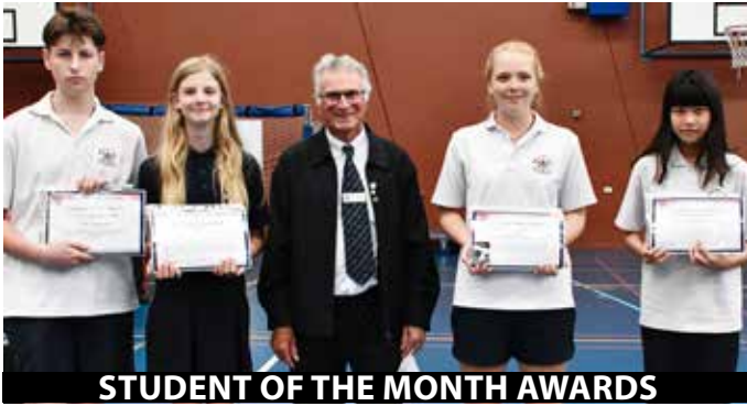
STUDENT OF THE MONTH AWARDS