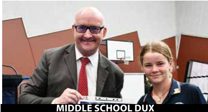
MIDDLE SCHOOL DUX