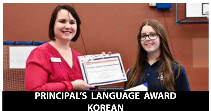
PRINCIPAL'S LANGUAGE AWARD KOREAN