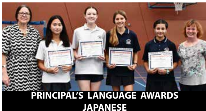
PRINCIPAL'S LANGUAGE AWARDS JAPANESE